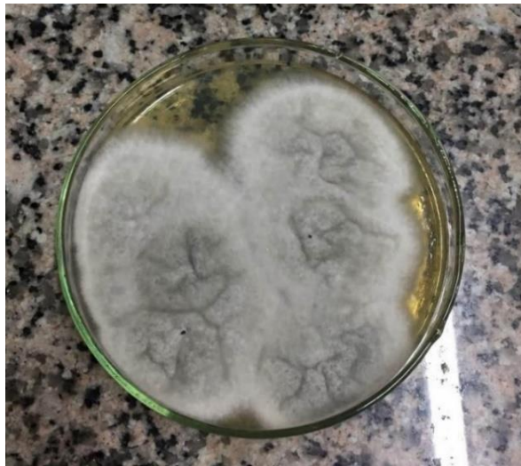
Figure 2 - Microbiological examination for fungal growth.

in sabouraud-dextrose agar with chloramphenicol. This means diluting the components with 100 mg chloramphenicol in 10 mL 95° C alcohol. It is necessary to add in 1 liter of agar sabourand dextrose (ASD) before sterilization: distilled water and adjust pH to 5.6 and heat to complete dissolution, then distribute about 10 mL per tube and autoclave at 120 ° C for 15 minutes.