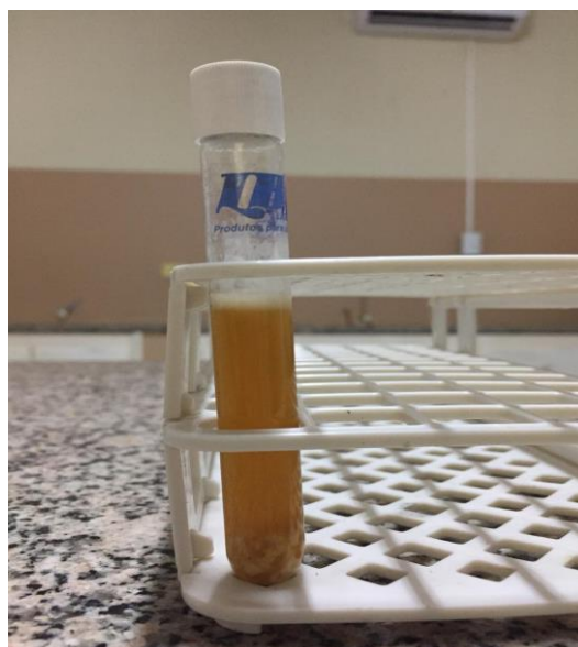
Figure 3 - Germ Tube Cultivation.

After initial screening that allowed the separation of yeast from filamentous fungi, they were submitted to biochemical and physiological tests, such as microculture in CornMeal medium to verify pseudohypha, chlamydoconid and blastoconid production, germ tube test and other complementary tests (Figure 3). For the identification of the resulting colonies, in the morphological microscopic analyzes, slides were prepared using lactofenol blue or clarifying cotton (sodium hydroxide - 20% noth in aqueous solution) (Figure 4).