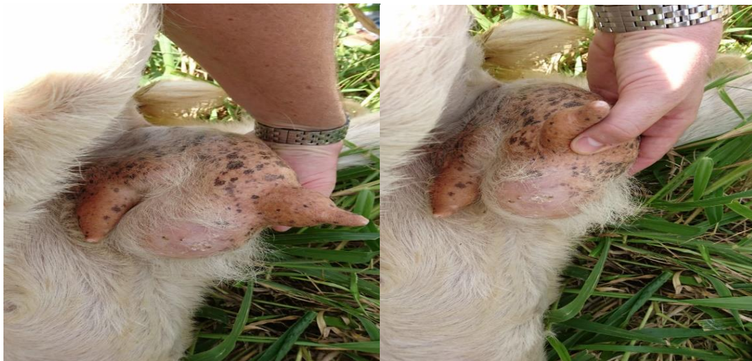
Figure 1 - Mammary gland showing characteristic signs of inflammatory process.

bpm: beats per minute; mpm: movements per minute; ° C: celsius degrees. Source: Veterinary Semiology (FEITOSA, 2008).